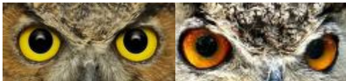
Owl eye colours

Owls see in the same way that humans do, with both eyes straight ahead. This is called binocular vision and enables the bird to judge distances accurately. Their eyes have adapted to