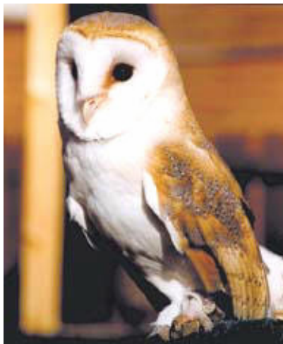
The European Barn Owl