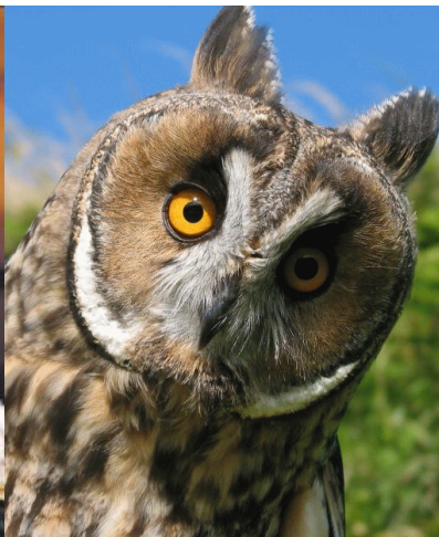
The Long-eared Owl